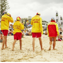
Patrols start 20/9/14 Are you financial?