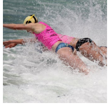
Competition World Titles & High Performance information