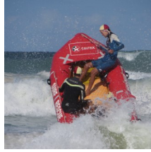
IRB Crew and Drivers Training register now