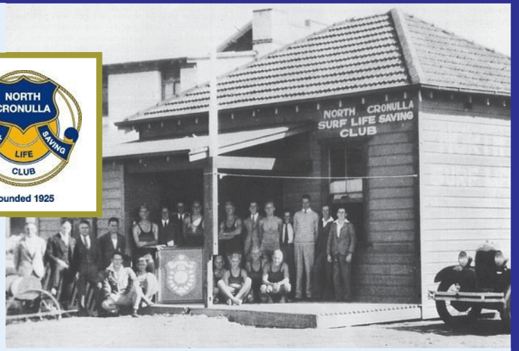
2nd Clubhouse – Opened 1932