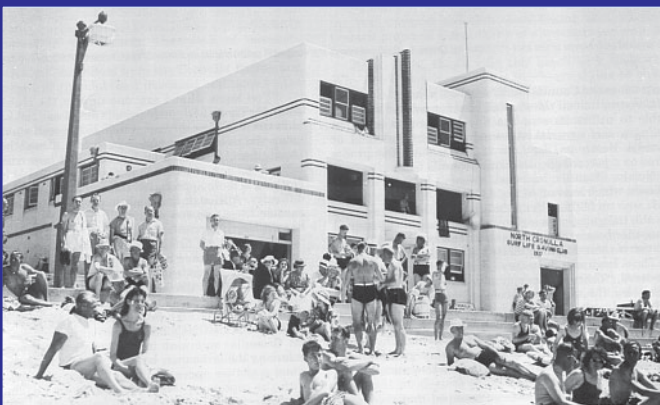
3rd Clubhouse – Opened 1937

See back of flyer for further details of weekend events