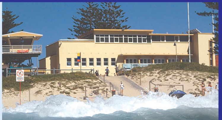
Present Clubhouse – Opened 1950