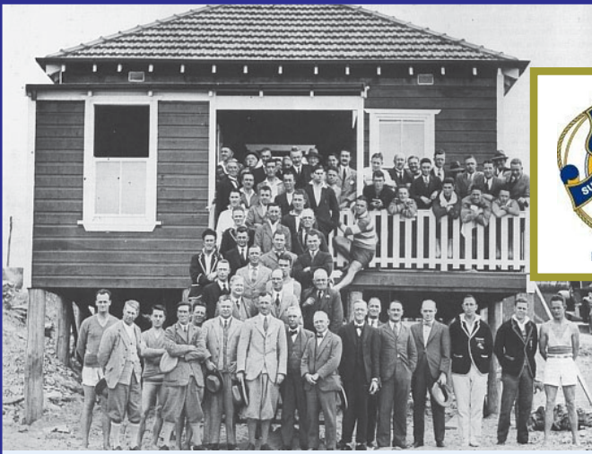
1st Clubhouse – Opened 1926